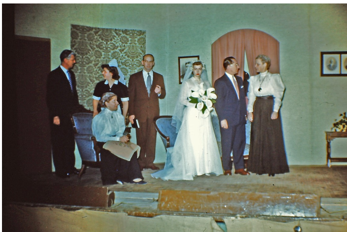
The cast on stage for Double Door (1953) at the old Waterville Elementary School. Note the foot-lights and the creative way the small stage was made to look larger.