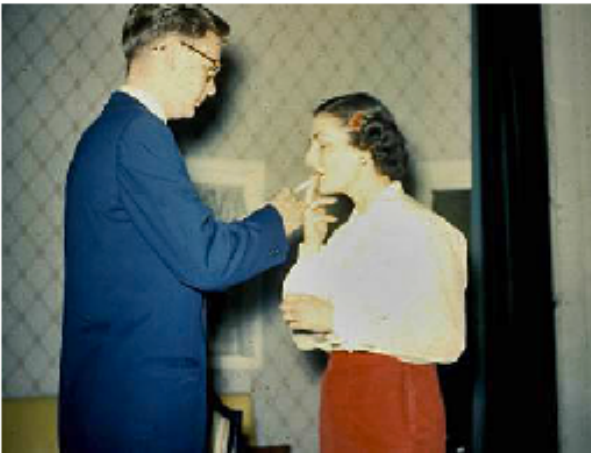
Scene from our first production, George and Margaret . Actors not identified.